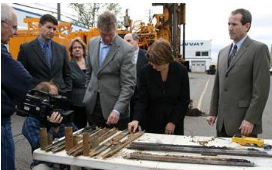
Collaboration and innovation are central themes in our work and that of our public, private sector and nonprofits partners.